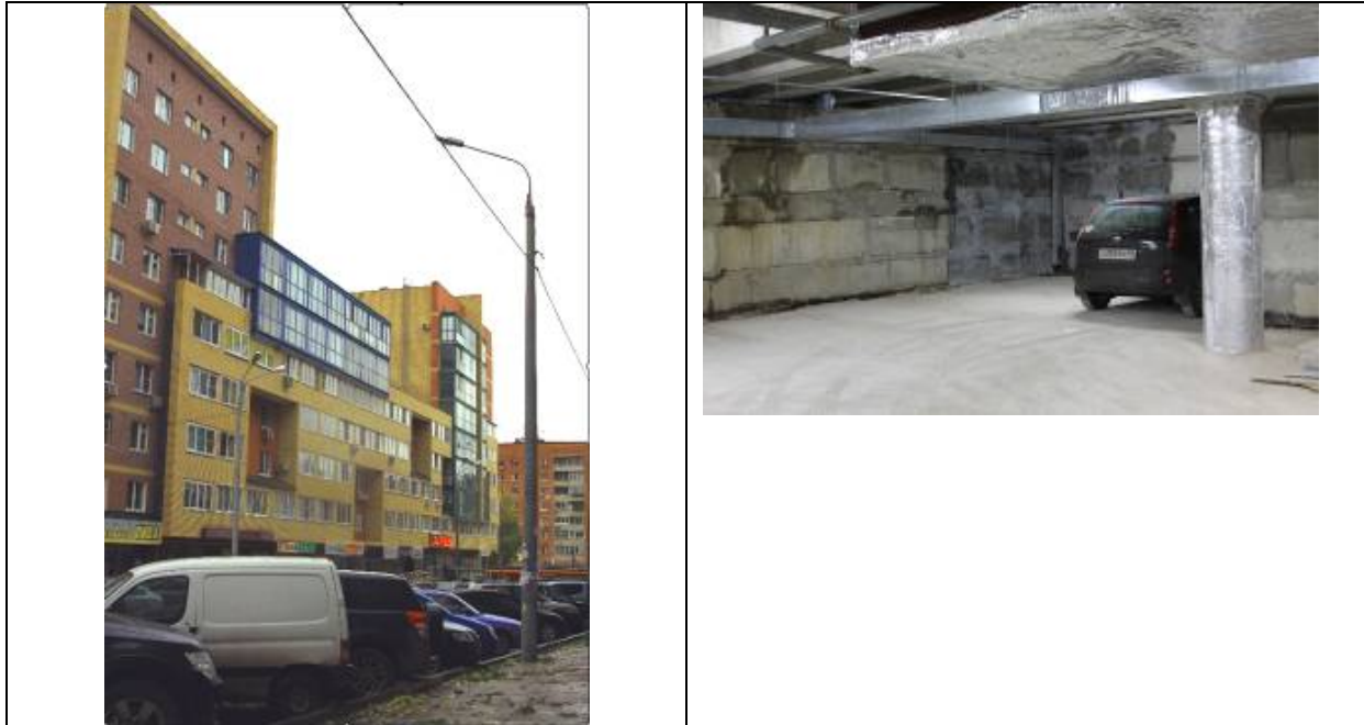
Figure 2. Some photographs showing the apartment complex with its underground parking