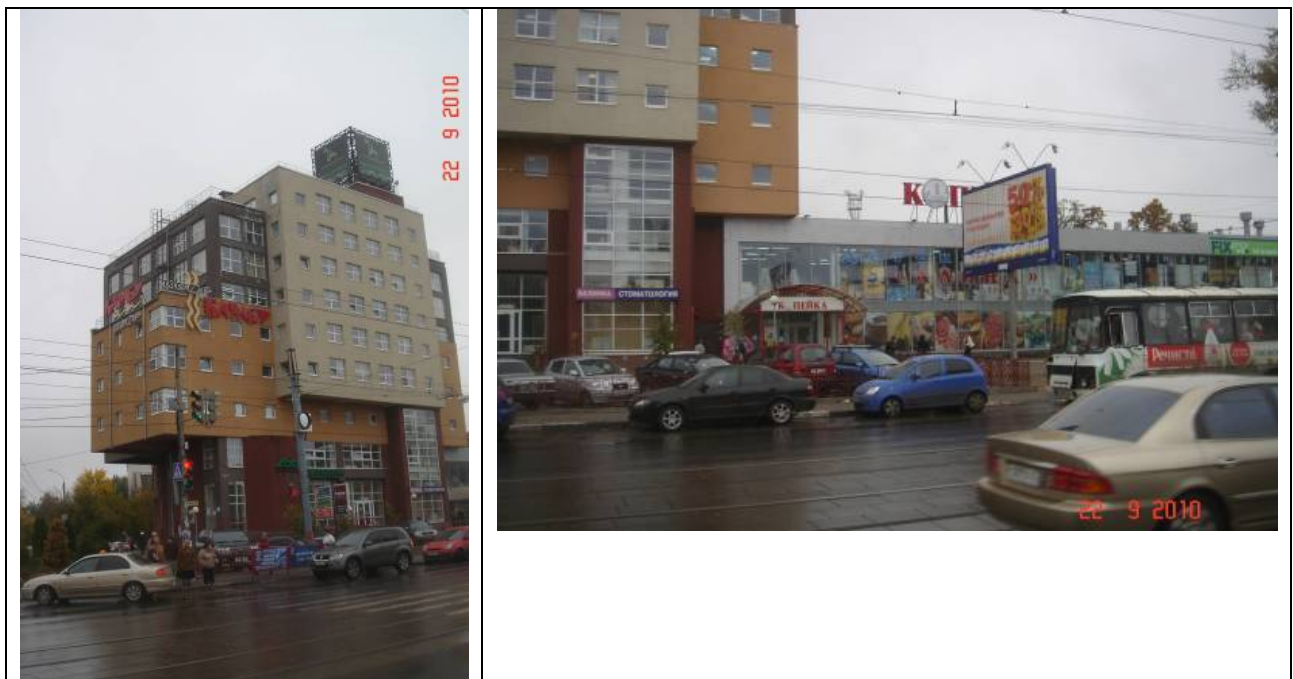
Figure 1. Some photographs showing the Teledom building and its environment

Case 1: The Teledom building (see Figure 1). This is a multilevel office building with an underground parking and includes a large number of units with various types of registered rights. One part overhangs the road and another part is located above other building located on a neighbouring parcel. Only the basement is represented within the land parcel on a 2D map.