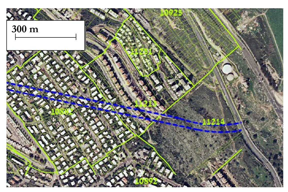
Figure 1: Orthophoto of a part of Haifa and the Carmel Tunnel layout (broken line), combined with blocks and parcels derived from the National GIS.

The "Carmel Tunnels" is a transportation project aiming to solve the traffic problems in the busy city of Haifa, using tunnels to connect the entrances to the city from different directions. (See Figure No .1.) The importance of the project is obvious as Haifa serves as the major city in the North. Haifa has a busy commercial port, a small international airport, most of the governmental and public services and a very developed industry which attracts, every day, many workers from the neighboring cities. Thus, the project is due to have a vast economic effect and to improve the quality of life, both in the city (by reducing the number of vehicles passing through) and surroundings.