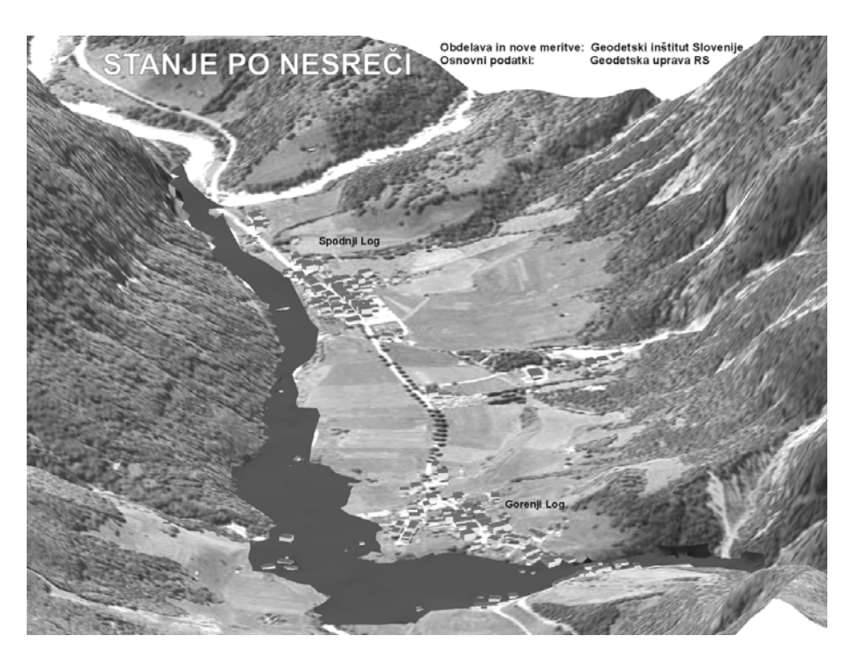
Figure 3: Visualization of situation after the landslide<sup>1</sup>.

Keeping actual 3D data on buildings on the national level is not feasible due to financial and methodological limitations. However, there is an emerging interest and there have been attempts on the part of individual local