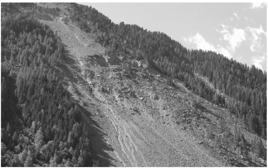
Figure 3. Example for height change caused by landslides

A problem for relative height definition with respect to the surface of the earth is that this surface may change. The reason for a height change may be a natural phenomenon, e.g., a land slide (compare Figure 3). It can also occur because of human actions, e.g., constructions. Road reconstruction, for example, may change the vertical position of the road either to minimize vertical movement or because a new base layer had to be created.