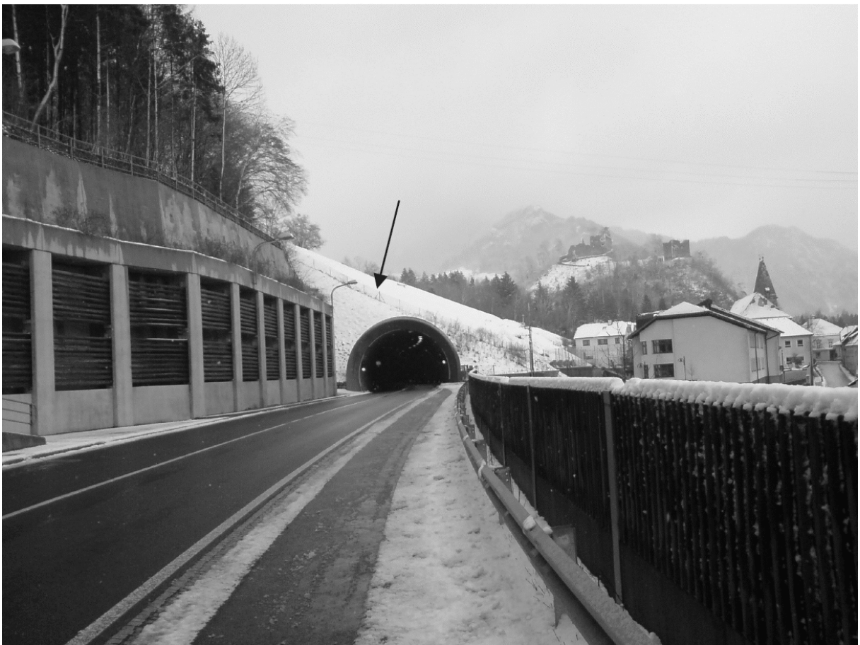
Figure 4. Example for a road tunnel close to the surface (Hackl 2007)

However, such tunnels are also built below cities, e.g., for the metro. In these cases the land above the tunnel is typically used for buildings. If the tunnel is built after the buildings on the ground then detailed knowledge is necessary on the buildings. Vienna, for example, has a large number of old buildings with up to 3 basement levels. Depending on the rock structure, this requires a vertical clearance distance for any construction work. The same clearance distance must be considered if creating a building on top of the metro. These vertical clearances are usually rounded to metres. Height information must be more precise to avoid problems. A 3\sigma -accuracy of at maximum 0.5 m is recommendable, which then leads to an accuracy of 16 cm.