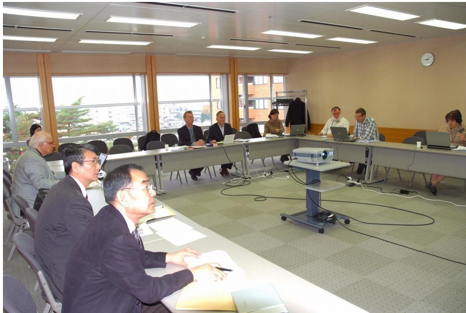
Figure 2. The project team at work in Tsukuba, Japan, 2008.

Consequently, in July 2009 a CD was submitted for approval for registration as a DIS. The decision to circulate a DIS is taken on the basis of the consensus principle . The definition of consensus by ISO is: "General agreement, characterized by the absence of sustained opposition to substantial issues by any important part of the concerned interests and by a process that involves seeking to take into account the views of all parties concerned and to reconcile any conflicting arguments. Consensus need not imply unanimity." The outcome of the submission for approval (October 2009) is summarized in Table 3.