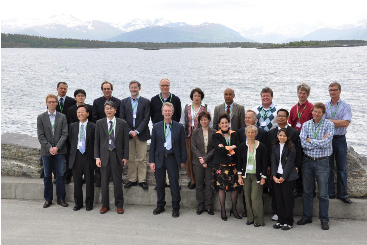
Figure 1. The Project Team in Molde, Norway, 2009.

(NGO), representing more than 120 countries throughout the world ( www.fig.net ). FIG is a liaison organization to ISO/TC211.