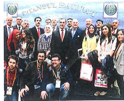
▲ At the front: Young participants.