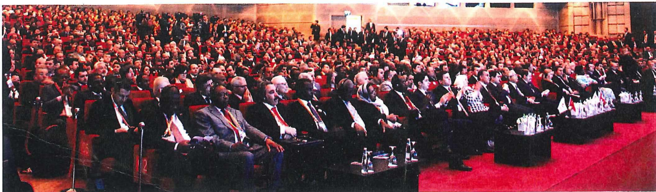
▲ WCS-CE attracted overwhelming interest from 90 countries.