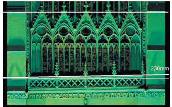
▲ Figure 6: Misalignment of the balcony of the south facade of Notre-Dame Cathedral in Amiens.

TLS has come a long way since the late 1980s. Performance and productivity have greatly increased, while the cost of ownership, size and weight have decreased. TLS is not yet fully mature, however. Manufacturers still recommend a yearly calibration to maintain the specifications. Standard warranty periods are just one year, whereas two years is