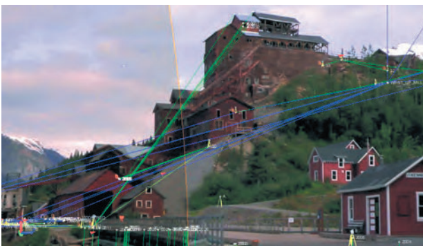
▲ Figure 4: A georeferenced photo mosaic of the Kennecott mill viewed from the valley floor, created using Trimble VISION.

The construction of Notre-Dame Cathedral in Paris, France, started in 1160. Although it is today regarded as a world-famous example of Gothic architecture, by around 1830 Notre-Dame was in such a state of decline that demolition became a serious option. Notre-Dame Cathedral survived the demolition plans, thanks in part to various citizen initiatives to save the cathedral – including Victor Hugo's novel Notre-Dame de Paris which was published in 1831 and later translated into English as The Hunchback of Notre-Dame . However, on 15 April 2019 a fire destroyed the spire, lead roof and oak frame of Notre-Dame. From the beginning it was clear that TLS would support restoration immensely. Although new TLS surveys allow accurate assessment of the damage, stability of the structure and required restoration works, they cannot provide information