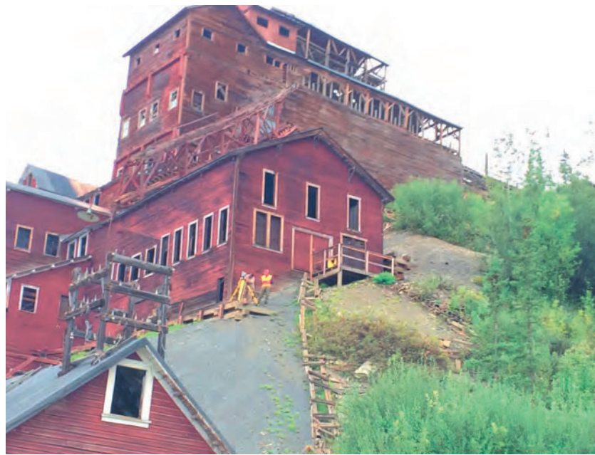
▲ Figure 3: Copper ore was milled and melted in furnaces in this building at Kennecott Mines, Alaska.

Kennecott Mines, Alaska, is a complex of abandoned copper mines and has been a US National Historic Landmark since 1987. The