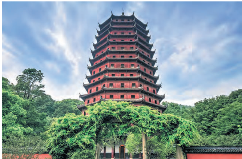
▲ Figure 1: The 13-storey Liuhe Pagoda at Hangzhou, China.

geometric transformations. However, an external high-end camera may be preferred for higher-quality imaging, although this requires more expert control. A necessity in the case of larger sites – and optional for