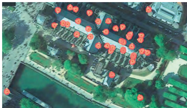
▲ Figure 5: In this aerial view of Notre-Dame Cathedral in Paris, orange circles represent the scan positions during the 2010 TLS survey.